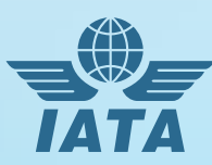
International Air Transport Association